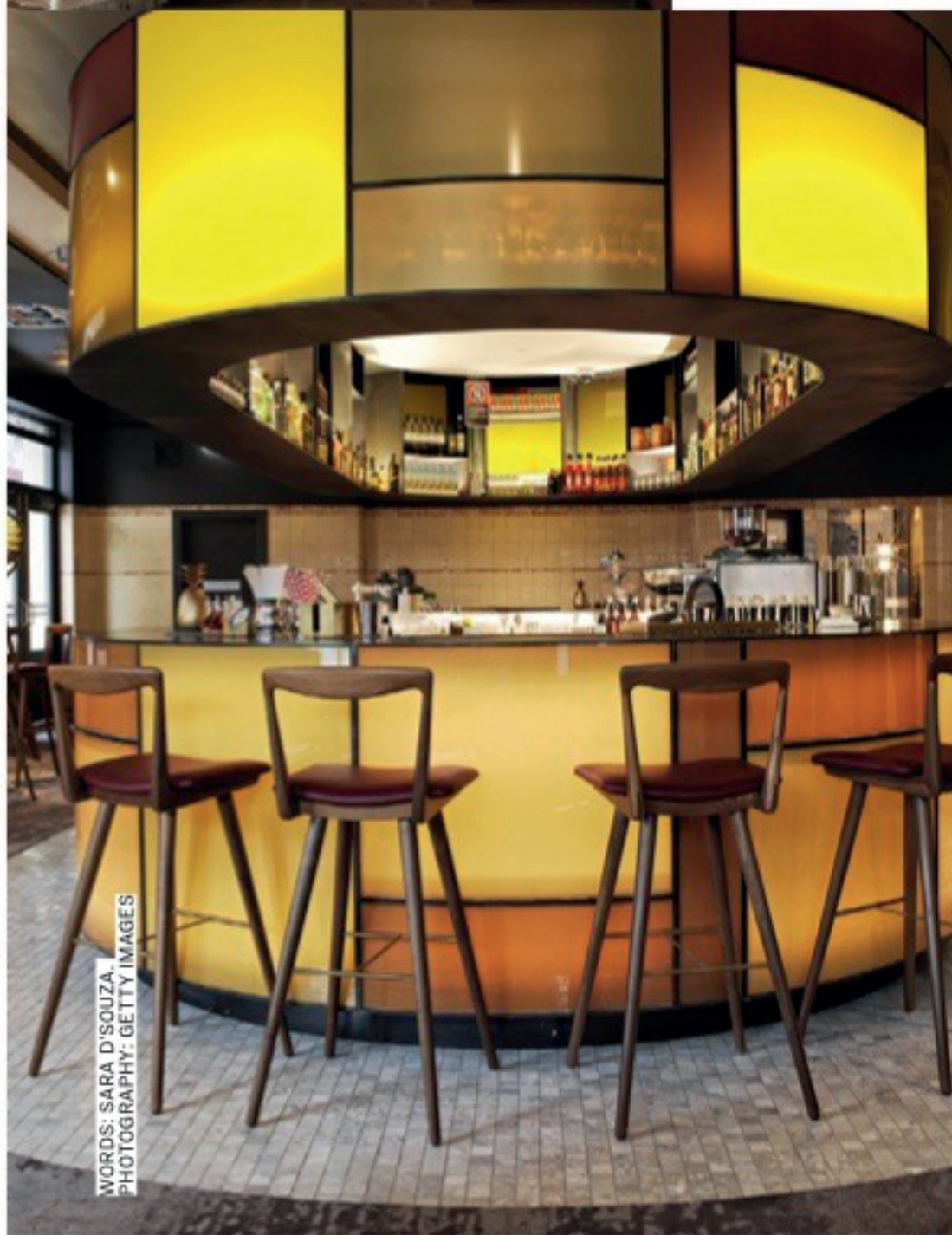
WORDS: SARA D'SOUZA

Chippendale is shaping up to be Sydney's hippest suburb. Skip down the New York-style herringbone-paved Kensington Street to see heritage terraces and the lantern-strung street-food market Spice Alley. Don't miss Glider for its smooth coffee served in ceramics by Liquorice Moon Studios.